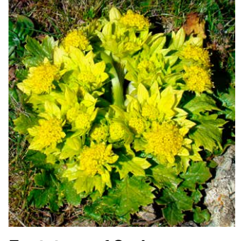
Footsteps of Spring