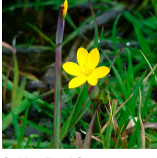
Golden Eyed Grass

very large plant can be more than 6 feet tall with huge leaves divided into maple-shaped leaflets. A flat cluster of flowers sometimes measuring a foot in diameter sits atop the stout hollow stalk.