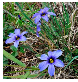
Blue Eyed Grass Bush Lupine