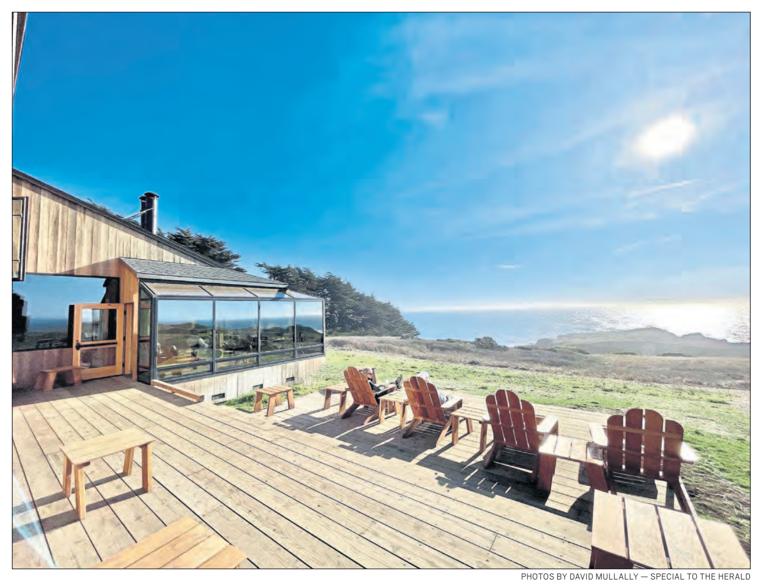
_ _ . . .