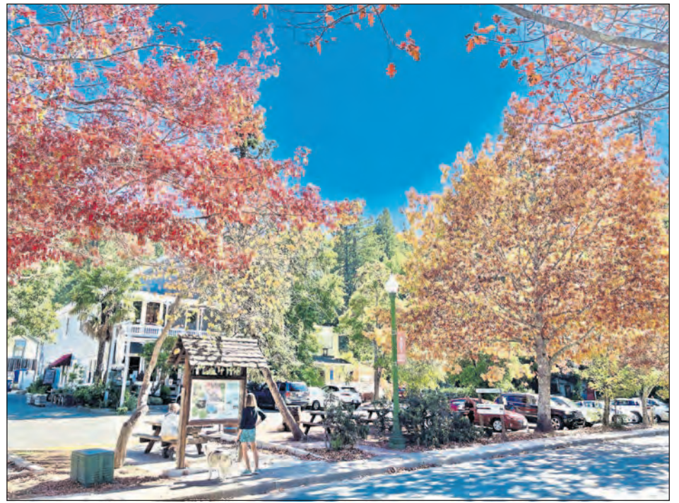
Occidental is cloaked in fall colors along the Bohemian Highway.

THURSDAY, NOVEMBER 4, 2021 MONTEREYHERALD.COM