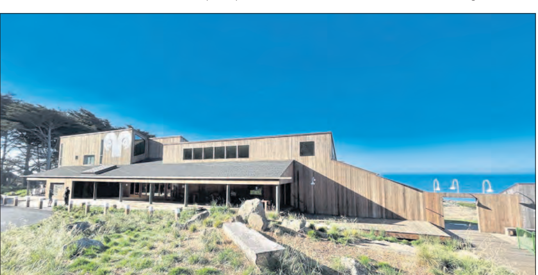
The Sea Ranch Lodge flaunts its revitalized exterior

and funky shops. Like Big Sur, Guerneville stands at the edge of a pristine natural realm vulnerable to flood and fire and the Reserve was still recovering from last year's blaze.